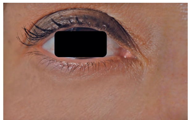
Figure 2. Post-treatment appearance of the lower eyelid after 6 months (T1). The skin laxity is reduced, and superficial wrinkles are smoothed. 102x81 mm (300x300 DPI).