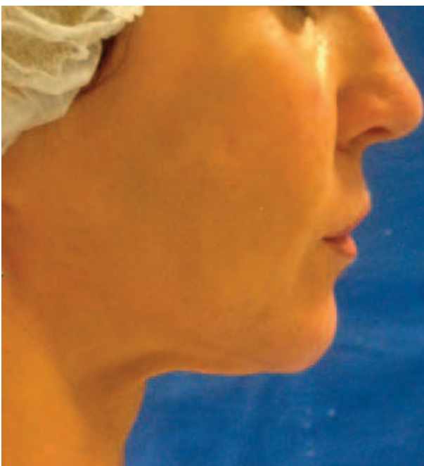
FIGURE 1. Pre-operative view